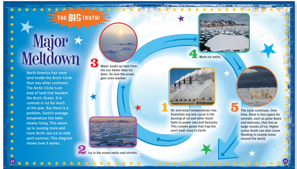
Sample spread from North America